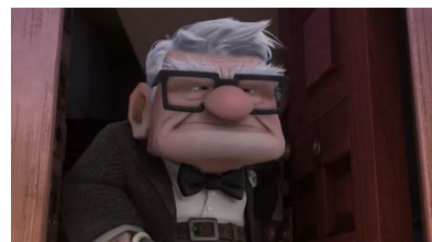
Figure.1 Carl Fredrickson (15:23)

Physiological dimension is discussing about the appearance of the character or how the character looks. In the movie it shows that Carl is an elderly man. It can be seen on figure 1, Carl is portrayed as an old man, he has white hair and wrinkled skin. Carl has blue eyes, a big nose, and wears square-shaped sunglasses, perhaps he has trouble with his eyesight which makes him wear glasses. Besides that the other proof that Carl is an elderly can be seen on data 1, the quotation " I'm elderly and infirm ", It can be seen that Carl calls himself as an elderly. Carl admits that he is not young and his body is not as fit as when he was young.