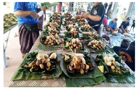
Figure 5. The arrangement of the satay dish

From typical Balinese dishes such as babi guling (suckling pig) and nasi campur (a mixed rice dish topped with a variety of side dishes), food for offerings, to organic food, Ubud offers authentic and fusion dishes. Legendary eateries and restaurants serving fusion dishes are highly sought after by the tourists. The popularity of Balinese cuisine in Ubud is undeniable – the tourists have known Ubud as a culinary haven. To see the development of Ubud's local food from the tourists' view point, following