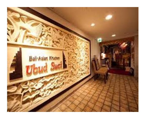
Figure 1. The exterior of Ubud Suci Restaurant in Japan Source:

"Ubud is a kind of place that "draws people...who are actively involved in art, nature, anthropology, music, dance, architecture, environmentalism, alternative modalities, and more. This restaurant uses furniture imported from Bali, and its interior décor creates the kind of relaxing and "healing" atmosphere so characteristic of Balinese resorts" (Kosaku, 2010:10).