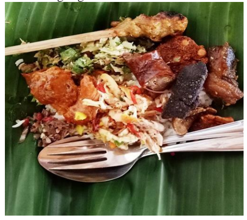
Figure 3. Nasi Campur Warung Teges

Nasi campur (a mixed rice dish topped with a variety of side dishes) is a universal menu that is very easy to find in all corners of the island of Bali. In Ubud area, mixed rice is a legendary dish consisting of various kinds of side dishes and vegetables. A legendary nasi campur menu in Ubud is Nasi Campur Warung Teges Bu Desak and Nasi Campur Ayam Kedewatan. Nasi Warung Teges, which is managed by the family of Ibu Desak, serves home-cooked dishes consisting of processed pork and chicken meat. Cooked with firewood, this mixed rice becomes very special despite its simplicity. The eatery is located in Teges and was established in the 1960s. Figure 5.4 below is nasi campur of WarungTeges.