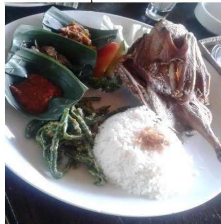
Figure 2. Bebek Tepi Sawah Crispy or Grilled Duck

Food in Ubud varies from local to fusion food, which is presented to foreign and domestic tourists. Bebek Tepi Sawah Crispy or Grilled Duck is the mainstay of Bebek Tepi Sawah Restaurant, located in Ubud and has branches in Tuban, Kartika Plaza Kuta, and Kuta Beachwalk. The average price of food and drinks at this restaurant ranges from Rp 50,000 to Rp 100,000. This restaurant is open from 10:00 a.m. to 10:00 p.m. and serves Grilled Cock Fighting Chicken. Figure 5.2 below is a crispy duck menu in Bebek Tepi SawahRestaurant.