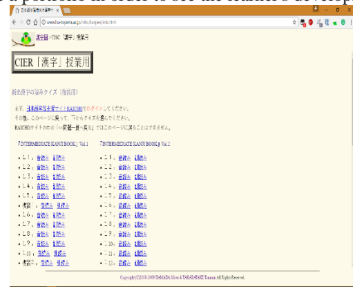
Fig. 2. Inside the option number 3 in the Kanji-en site where learners could choose among many exercises available accordingly to the textbook that is used.

will have to write in hiragana letters, the exact kanji combination reading in the empty box provided in each question. After completing the entire box learner can check their answers to these questions so that the learner can match the reply with the correct answer by pressing the "Check" button located under the last question of each exercises. The results of those works can be printed to create a portfolio in order to see the learner's development.