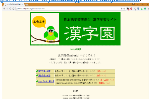
Fig. 1. Kanji-en site which has three options that can be used.

Many Japanese language learning media has been digitally created and available for access from all over the world. Associated with Kanji learning, there is a site that provides Kanji learning exercises for free. The site, often called Kanji-en (漢字園 'Kanji Garden'), was designed by faculty members at the International Student Center, Toyama University, Japan. On this site, there are exercises, especially reading exercises that are useful for Kanji learners to improve aspects of Kanji's reading ability. Of course, through a few modifications, the exercises on this site can also be utilized in order to improve the ability of Kanji mastery on other aspects. This site can be accessed via http://www3.u-toyama.ac.jp/niho/kanjien.html .