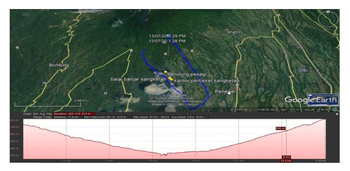
Figure 3. The spiritual tour starts at Tambawaras temple and ends at the sublime temple of Batukaru, and vice versa.