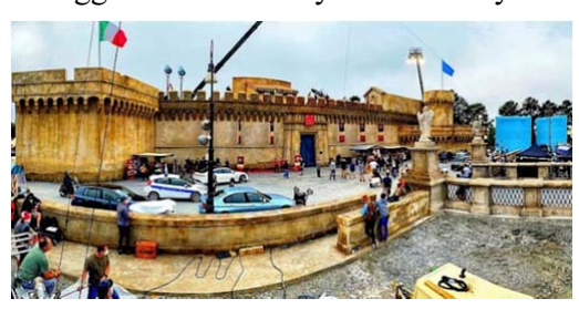
Data 3. Scene at 00:05:29-00:06:58

The data provides a scene where Nolan Booth is being chased by John Hartley after noticing someone run when the egg is found fake by John Hartley.