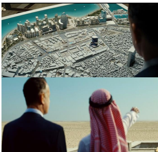
Figure 5: The dream vs the reality

and the vast emptiness of the desert where the city will be built (see figure 5 right). This “wishful thinking” is then negated by one of the salespersons who admits that no one yet makes any commitment to purchase any condo unit. In addition, their attempt to draw prospective buyer by placing a “fake” coming soon ads of a Western fast food restaurant chain such as KFC and Starbucks is another interplay between the promising mirage they try to create and the reality they face.