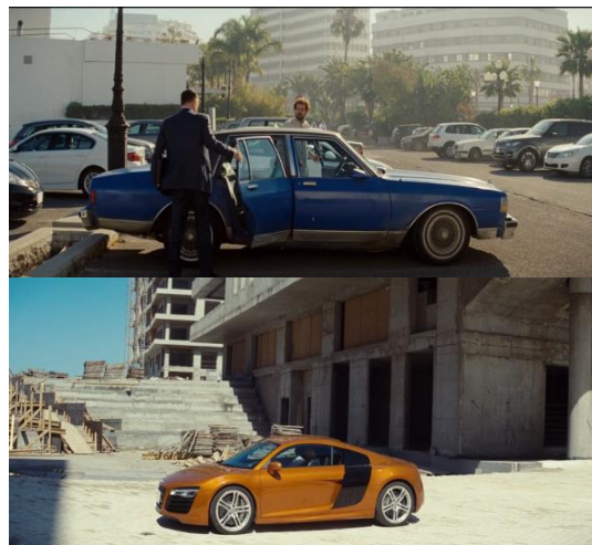
Figure 4: contrast setting and props

Figure 4 above shows playful shots that emphasize the interplay between "mirage/reality". Yousef's car in the left shot is contrasted against the expensive cars and the towering buildings. In the right shot, Kareem's sports car seems to be out of place when it is placed in the center of an unfinished empty condos. The empty building fittingly represents the mirage: the wishful thinking of the developer to have a magnificent city in the middle of the desert when he shows the miniature model of what the city will be like (see figure 5 left)