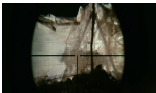
Figure 1: The wolf

The turning point of Clay’s life that makes him decide to further his relationship with Zahra is during wolf hunting in the desert. In that scene, the audience do not actually see the wolf but its shadow behind some hanging clothes (see figure 1). The shot in figure 1 is a clear example of how the interplay between mirage and reality is shown. It represents a mirage because no one can tell for sure what animal lurks behind the screen, and no one can predict what it will do. We learn that the wolf seems hesitant when it is so close to the sheep, and eventually it goes away. I argue that at that critical moment for the wolf, Clay sees himself as the wolf who merely attempts to survive in the bizzare, incomprehensible situation. When he decides not to shoot the wolf, he is actually giving a chance not only for the wolf to survive, but most importantly for himself. From that moment on, Clay becomes more determined to survive or revive, in his case by making a move toward Zahra.