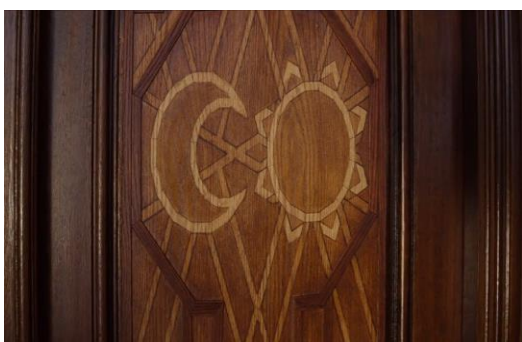
Figure 8: The sun and the moon

The film ends with the shot of the front door of Zahra's house that has a carving of the moon and the sun (see figure 8). The two entities represent two aspects that can never be together, yet they are there side by side, which suggests a reconciliation between two cultures that is actualized by Clay and Zahra's relationship. This final shot also cleverly displays the interplay between mirage/reality by placing them side by side.