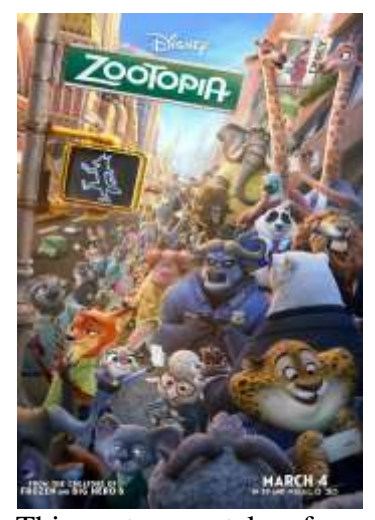
This poster was taken from http://www.moviesnowshowing.com/movie/3558/zootopia.html .

There are six verbal signs found in the first poster. The first verbal sign is "Disney", which indicates that it is the company that produces Zootopia movie. "Disney" is the name of a company that produces and provides many great entertainments. The second verbal sign is "ZOOTOPIA, which is the title of this movie. The third verbal sign is "FROM THE CREATORS OF FROZEN AND BIG HERO 6", which signifies that the creator of Zootopia movie is the same as the creators of Frozen and Big Hero 6 movies. The fourth verbal sign is "MARCH 4", which provides the information to the viewers about the release date of the movie. The fifth verbal sign is "IN 3D AND REALD 3D" that signifies that this movie is in a good quality (3D and REALD 3D). The sixth verbal sign is "DNKY", which may signify that it is a brand name of the bag or dress worn by the model.