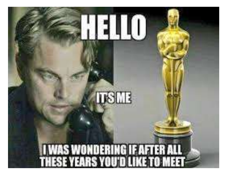
This meme was taken from website www. memecenter.com.