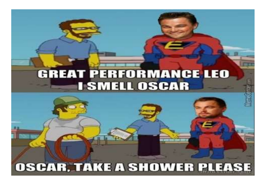
This data was taken from website www.memegenerator.net.