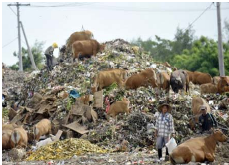
Figure.1. Bali cattle at Suwung Dump Site of Denpasar, Bali.

Therefore, Bali cattle lose their habitat dramatically. The fact is in general agreement with Kasa (2012) who reported that as a consequence of habitat lost, then Bali cattle has been concentrated and found in Cargo street and Suwung dump site of Denpasar city. In addition, it was noted that number of land use change per year is about 800-1000 hectare (Bali Post, 2012). According to Arthana (2015), in 2013 land use change increase gradually in comparison to 2007. For examples, decrease number of paddy rice field in 2007 was 81482 hektare, meanwhile, in 2008 and 2013 were 81235 hektare and 81165 hektare respectively. Moreover, results could also be supported by decreasing number of farmers. For example, the data clearly proved that from 2003 to 2013 total population of farmers were incredibly decreased about 16.98 percent from 491725 down to 408229 respectively (BPS, 2015). Such decreases was highest in the city of Denpasar (46.23 percent), meanwhile, the lowest was happened in Bangli regency (3.53 percent).