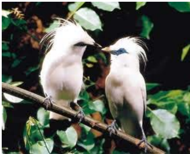
Figure 3. Bali White starling ( Lencopsar rothschildi ) (BirdLife International. 2013).

since its discovery. In more detail it was reported that, such declined mostly as a result of the illegal collection of birds for the captive bird trade (Craig and Feare, 2010). Additionally, despite the entire Bali starling population being within a national park, illegal trapping of this species continues, a threat which is further compounded by habitat destruction, interspecific competition, natural predation and disease (BirdLife International, 2013).