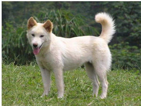
Figure 5. Balinese dog of Kintamani.

Importation of many pedigree dogs are probably the main cause of rabies emerged in this island. According to Winn (2014), importation of cats and dogs has always been against the law in Bali. However, many pedigree dogs were smuggled in the island, for expats and also for Balinese who may consider it as a status symbol. As the expat population increased over the last several years and because of a greater demand for these pedigree dogs, more dogs are being imported in Bali (Charlton, 2015).