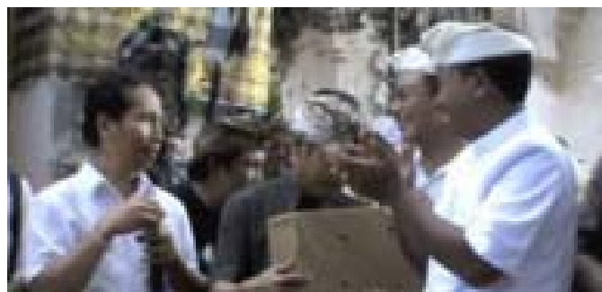
Figure 4. The Governor of Bali Release Bali Starling to Nature.

Balinese dog (Canis lupus familiaris) . Balinese dog is shown in Fig. 5. Meanwhile Fig. 6 showed, a mass killing of street Balinese dog. Before 2008 Bali island has been declared as the island of rabies free. As time goes by, total number of Bali dog declined due to many factors. The fact is in gentle agreement with BAWA