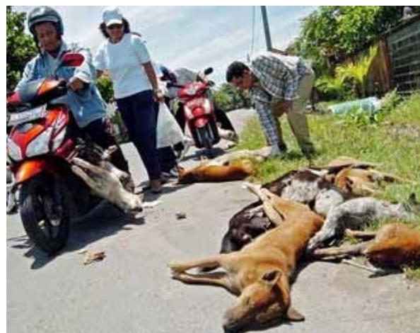
Figure 6. Street dog killing due to rabies.

Overall, it could be concluded that animal biodiversity of Bali (Bali cattle, Bali starling and Bali dog) are all threatened because of