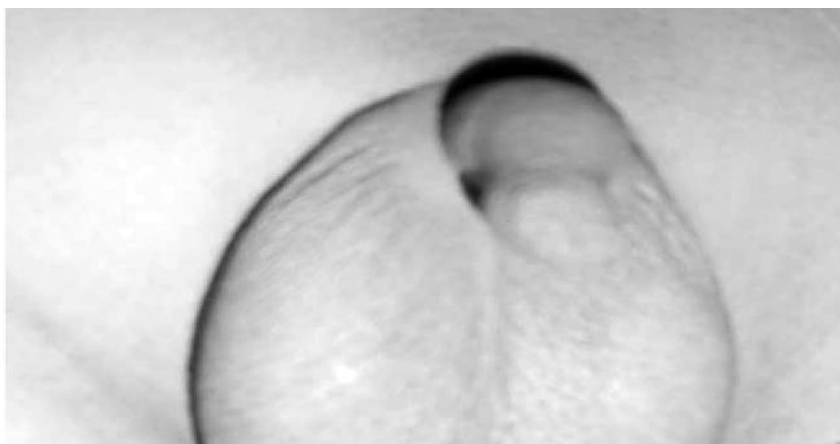
Figure 1. Micropenis and no pubic hair.

olfactory tests consistent with the conclusion of anosmia. Magnetic resonance imaging test revealed no apparent olfactory bulbs regarding the