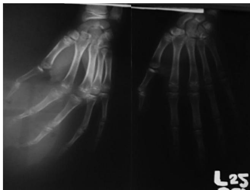
Figure 3. Rontgenogram of left hand: bone age was appropriate for 14 years old child.