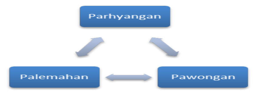
Table 2. The Concept of Tri Hita Karana

Balinese society is strongly believed in the relations between Gods, the individuals, and the environment. The relationship between the three aspects can be seen by the concept of Tri Hita Karana (three ways of peacefulness) that has the notion of (1) harmony to the God ( Parhyangan ); (2) harmony to people ( Pawongan ); and (3) harmony to the environment ( Palemahan ) (Access in <a href="http://www.thejakartapost.com/news/2010/03/15/nyepi-'tri-hita-karana'-and-development.html">http://www.thejakartapost.com/news/2010/03/15/nyepi-'tri-hita-karana'-and-development.html</a> (5 December 2015). The relationship of these three notions can be shown below: