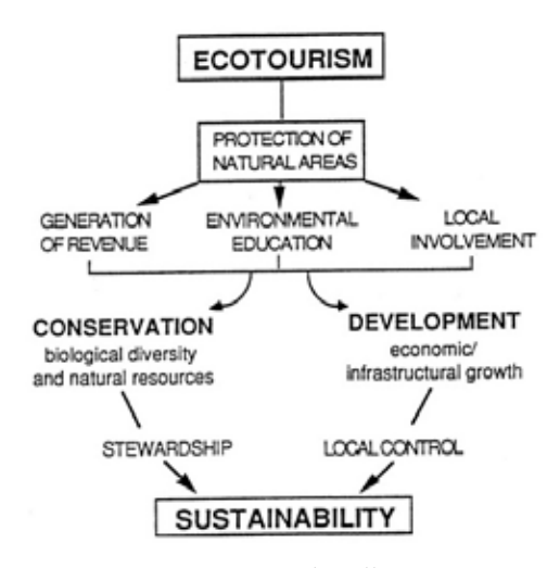
Figure 1. Ecotourism protects the environment while contributing to socio-economic development, and thus strives

conservation approach, within the framework of achieving economic benefits (Inskeep, 1991). The central idea lies on protecting the environment at the same time as improving the livelihoods of the local communities. This movement is about balancing between strategies of environment protection and meeting the local needs. As environment is an important tourist attraction (Fridgen, 1996), thus biodiversity conservation and environmental protection are essential to ensure the sustainable development of any tourism destination (UNWTO, 2015).