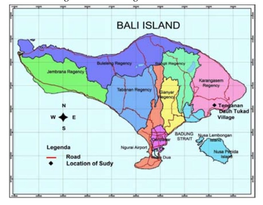
Figure 3. Site of Tenganan Dauh Tukad

The residents of Tenganan Dauh Tukad are a community of approximately 125 households (784 individuals). Most of them working in agriculture and plantation sector (50%) that produces coconut, banana and other fruits; around 20% working in the small-scale industry, 20% working in private companies and the rest 10% are those who work as government officers.