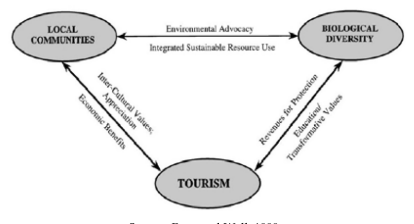
Figure 2. The ecotourism paradigm

To be successful in managing ecotourism site, Ross and Wall (1999a) proposed an important ecotourism paradigm, which integrate three key elements include local communities, biological diversity, and tourism activities.