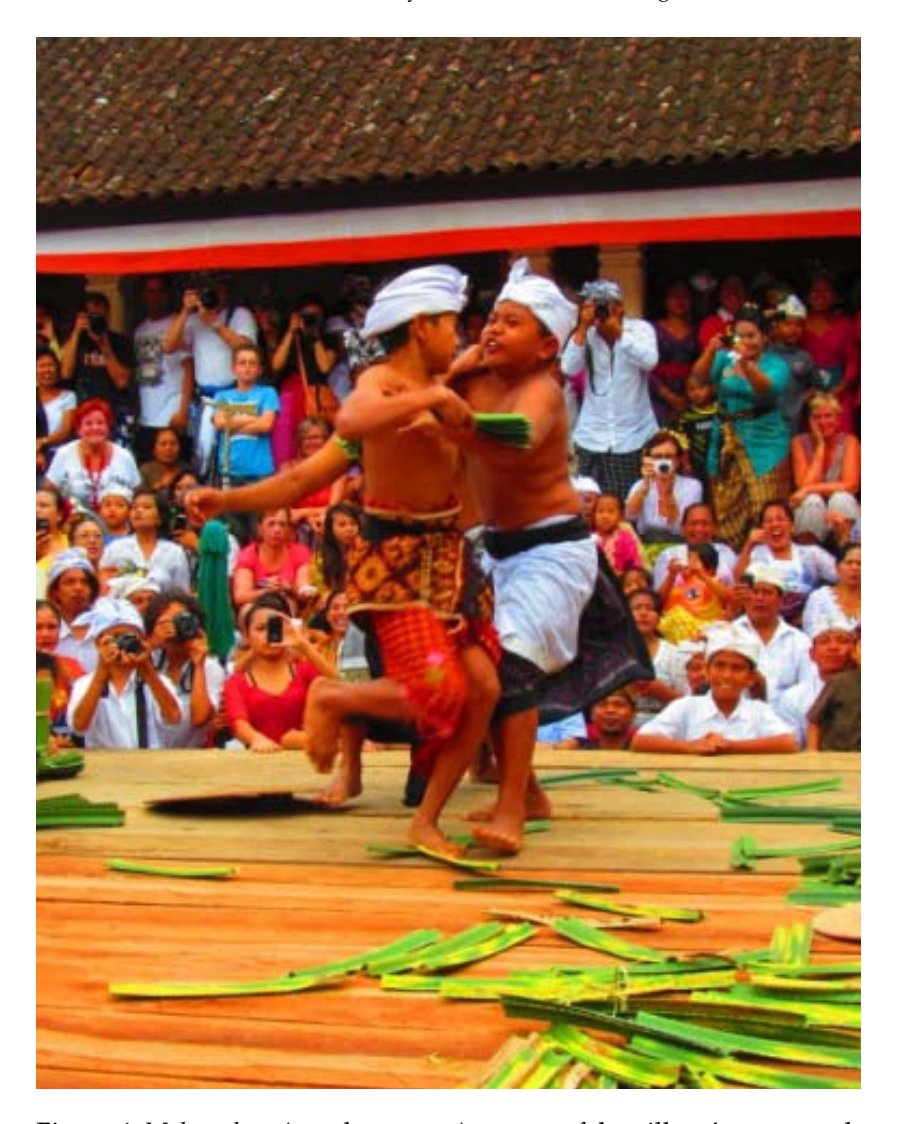
Figure 4. Mekare-kare (pandanus war) – s part of the village's one month ritual procession, which serve as Bali's annual tourism event

cultural tourism and adventure tourism. Activities include some combination of short/long distance trekking, visit to the villages and its traditional lifestyle, and nature/scenery appreciation through forest and Pengilihan Hill.