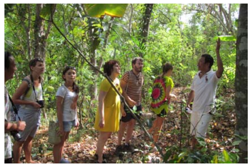
Figure 5. Trekking activities which combine mountainous hiking, education of biodiversity and scenery appreciation