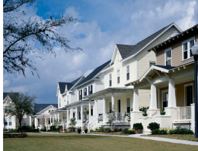
Figures 2 and 3 New Town of Celebration Florida