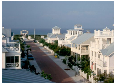
Figures 4 and 5 New Town of Seaside, Florida

Indeed the movement has now grown so large that it has councils in many other countries e.g. the U.K., Australia, etc. An evaluation of New Urbanist Design is now part of Malaysia's Tenth national Plan (p 256) under chapter six- 'Building an Environment that Enhances Quality of Life' and China's progress to Making New Urbanism is the subtitle to China's Emerging Cities (Wu 2008). Clearly the New Urbanist Agenda is now a global phenomenon. Most important however is the question of how this New Urbanism or 'Neo Traditionalism' deals with the problem of the vernacular , since this is our focus of concern in Bali. In principle the new urbanism is a revisionist movement in the sense that it revises and incorporates what has come before. So it is inherently oriented to the idea of the vernacular. This has resulted in some criticism over reactionary tendencies which perhaps too frequently copy the past rather than re-interpret