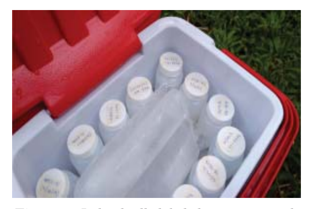
Figure 2. Individually labeled containers with milk samples ready for transport.