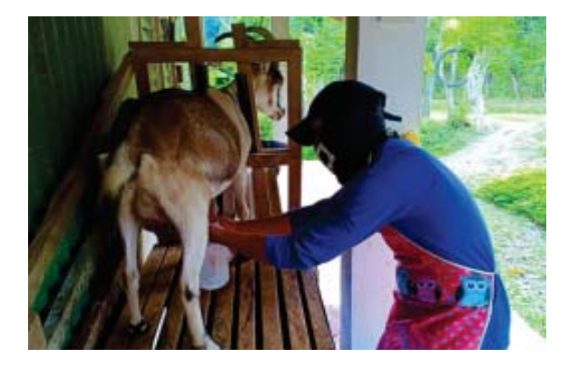
Figure 1. Milk collection in an Alpine x Anglo-Nubian goat at Malitbog Goat Center using a dedicated collection crate.

Milk from each udder (100 mL each) was divided into two 50-mL samples and placed individually in clean plastic containers. The containers were labeled accordingly, stored inside an insulated box filled with ice and transported to the laboratory overnight for physicochemical analysis (Figure 2).