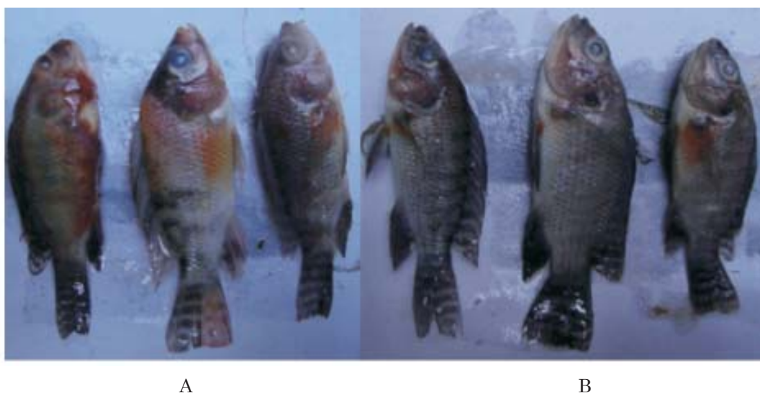
Figure 2. The profile of condition of fish untreated with plant extract, exposed bacteria (A) and treatment with plant extract, exposed bacteria (B)