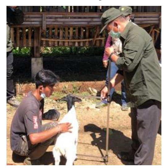
Figure 1. The measurement of head height by the researchers

taken from their around. Based on the relatively similar feed pattern of both goats observed, it is expected can minimize the influence of feed on their morphometric performance of them.