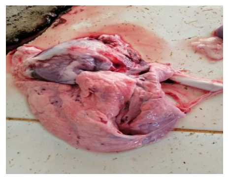
Figure 3. Local pig lung (necrosis)