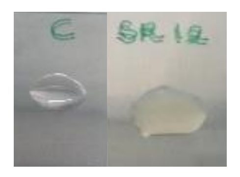
Figure 2. Result of catalase test on LAB SR 12 isolates. SR 12 isolates showed negative results.

peroxide (H2O2) into 2 molecules of water (H2O) and 1 molecule of oxygen (O2). Catalase test results on LAB SR 12 isolates are presented in Figure 2.