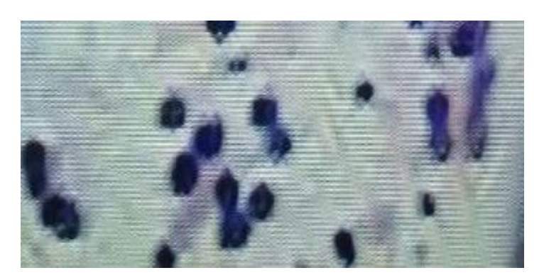
Figure 1. The results of Gram stain LAB isolate SR 12. The results of Gram staining bacteria showed that bacteria were Gram positive bacteria with a coccus shape

Gram staining results (Figure 1) show that LAB isolates SR 12 are Gram positive bacteria, and bacterial cells are coccus shaped. Based on its form, lactic acid bacteria SR 12 isolates belong to the genus Lactococcus , Aerococcus , Enterococcus , Streptococcus , Pediococcus , Leuconostoc [6].