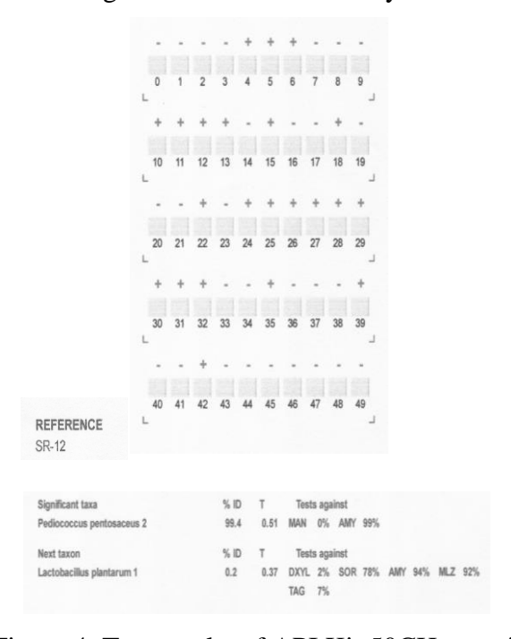
Figure 4. Test results of API Kit 50CH on apiweb

(A). Positive results (microtube no. 11) are marked by changes in color from blue to yellow; (B). Negative results (micotube no. 20) are marked with no discoloration; (C). On microtube no. 25 positive results were marked by reddish-black discoloration, this was due to hydrolysis of esculin ferric citrate to esculitin and glucose. Color changes caused by exculitin. The test results in Figure 3 are briefly as shown in Figure 4.