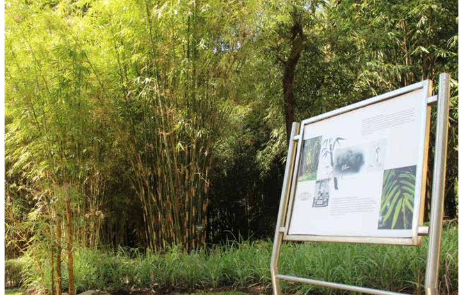
Figure 1. Bamboo Garden.