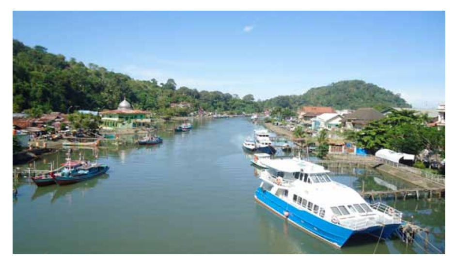
Photo 3. The view alongside of Batang Harau River (personal collection)

10 p.m., while on the weekend they open until 11 p.m or even midnight. Their reasons for selling are the demands in terms of economic problems as well as taking the benefit of their free time (See Photo 4).