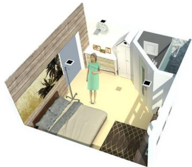
Fig. 6. the concept of birthing space for VIP