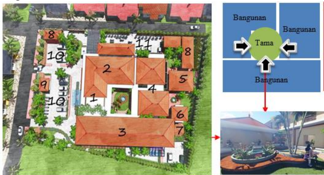
Fig. 2. Concept

The concept of homey in building masses in the maternity clinic aims to give a nuance of the house with orientation to the building, namely the presence of parks as the main focus or the liaison between building masses with one another like the arrangement of building masses in a Balinese house (Figure 2).