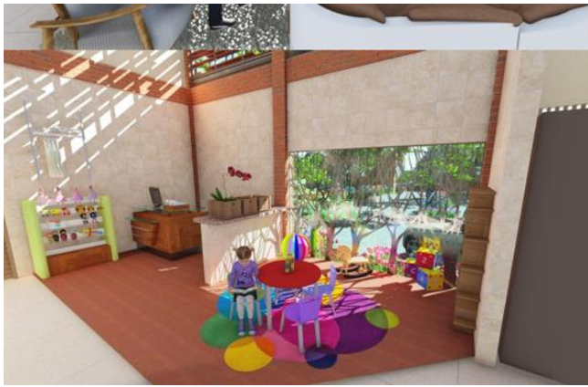
Fig. 4. Interior Concept

The concept of homey in the delivery room in this clinic focuses on privacy or intimacy of the civitas in the use of space, namely a delivery room used for one person so that the civitas labor will feel comfortable. The delivery room is designed for the comfort of the civitas do natural childbirth by lying in bed or can also by squatting which certainly requires adequate free space in the delivery room accompanied by her husband or family so that moral support can be felt by the civitas as labor in labor House.