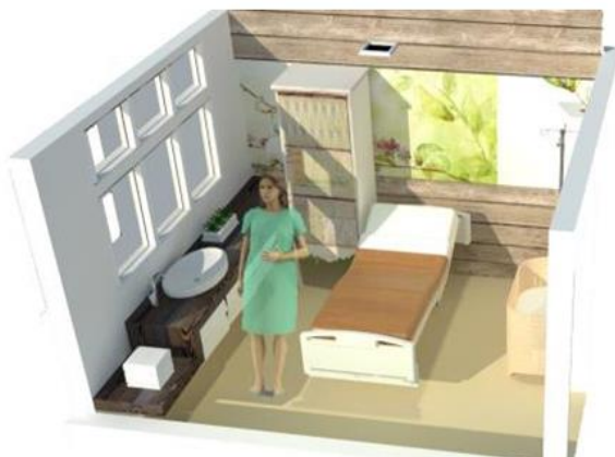
Fig. 5. the concept of birthing space

The concept of VIP delivery room is designed with a double bed so that in the process of giving birth to pregnant women can be accompanied by their families. The advantage of this VIP delivery room is that there is sufficient space between the bed and the zinc so that pregnant women can warm up before delivery in that area ( Figure 6).