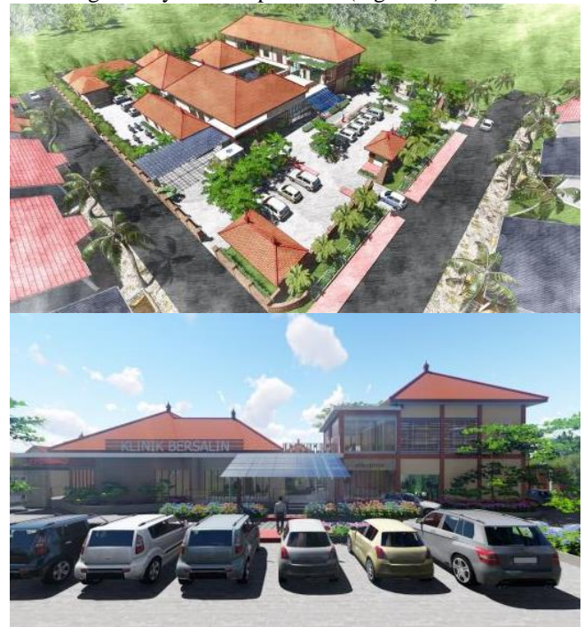
Fig. 2. Perspective

clinic is the rhythm of the proportions of the building by combining the 1st floor building with the 2nd floor building so as to give a dynamic impression. (Figure 3).