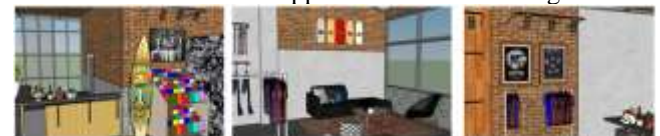
Fig. 4. Decoration

A decoration and artwork can be added to add aesthetics to the interior design. Artwork is also able to show the identity of a clothing brand. Decoration and artwork are added to the elements of the floor, wall or ceiling. The use of decoration or artwork should not be excessive and as much as possible has a certain function. Display items to be sold can also be used as art work. Some of the artwork and decorations that are applied can be seen in Figure 4.