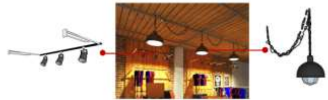
Fig. 3. Lighting

lighting is very important in the interior design of the distro. Placement and good lighting colors can certainly increase the selling value of a product. The main function of the distribution for product display will make the many uses of spotlight to support display lighting. In the application of industrial concepts, of course the selection of types, shapes and materials supporting the lamp becomes very important to support the material making up the space elements. The lighting color of the lamp is also very decisive in forming the atmosphere inside the distro. For more details, see Figure 3.