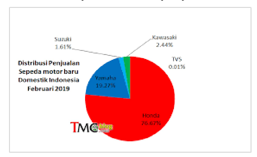
Figure 1. Distribution of New Domestic Motorcycle Sales Indonesia February 2019

The purchase decision refers to an act of deciding to use an item or service based on the profit and loss calculation. Deciding means choosing one of two or more alternatives. Thus, consumers select between objects (goods, brands, shopping places) or choose between alternative behaviors concerning the prevailing items. Moe and Fader (2004) and Park and Fader (2004) examined consumer behavior for browsing information that influences their likelihood of purchasing. Bucklin et al. (2002) and Yadav and Pavlou (2014) do some experiments to examine experimented the extent to which aggregate session-level clickstream data could predict each consumer's purchase decision. Moreover, Goh et al. (2013) and Wells et al. (2011) are interested in examining factors influencing online consumers' purchase decisions from various perspectives. They focus on how the sequential information in consumers' page viewing behavior influences purchasing decisions. The sequential information shows a customer's dynamic strategies in seeking product information. This behavior drives motivation and explains how the subsequent purchase decision occurs.