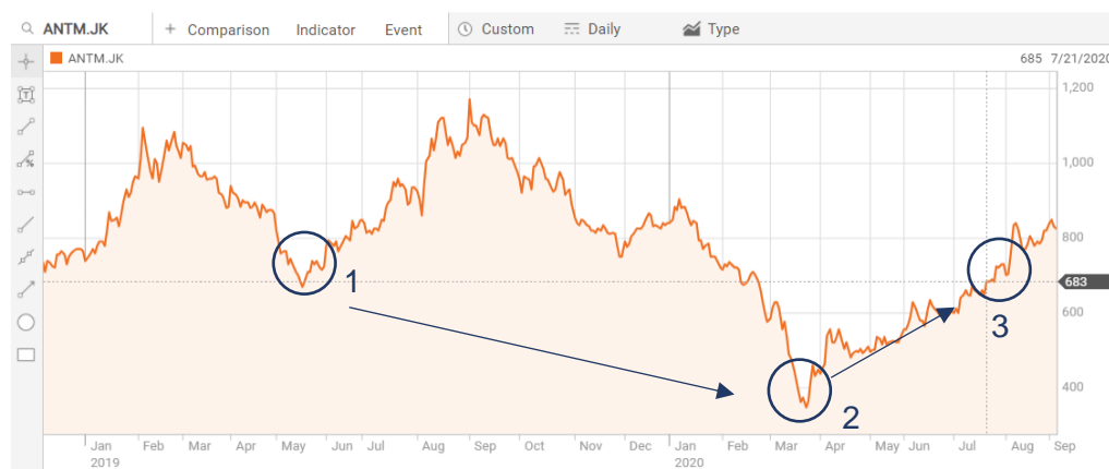
Figure 2. Time to Recovery Calculation Simulation

recover to their lowest value in 2019 from the lowest point in the 2020 period, with the standard value deviation of 137.9776 days. The standard deviation value, which almost equals the mean value, illustrates that the data distribution is quite varied. The average recovery time is much faster than the time needed by the market indices in the five countries to recover to their lowest point in 2019.