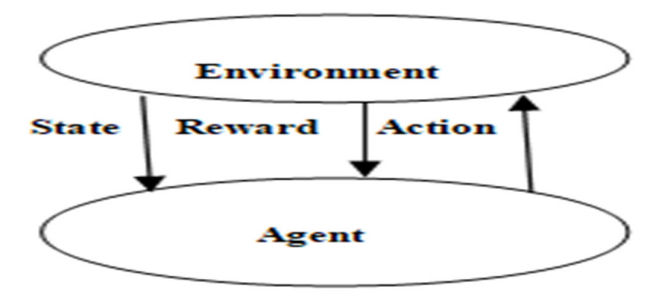
Fig (3): Elements of reinforcement learning

machines and programming administrators to, therefore, choose the ideal direct inside a specific setting to expand its introduction. Direct prize information is required for the administrator to acknowledge which movement is perfect; this is known as the support signal. Basically in support learning, five sorts of components exist let me show you with the assistance of figure (3).