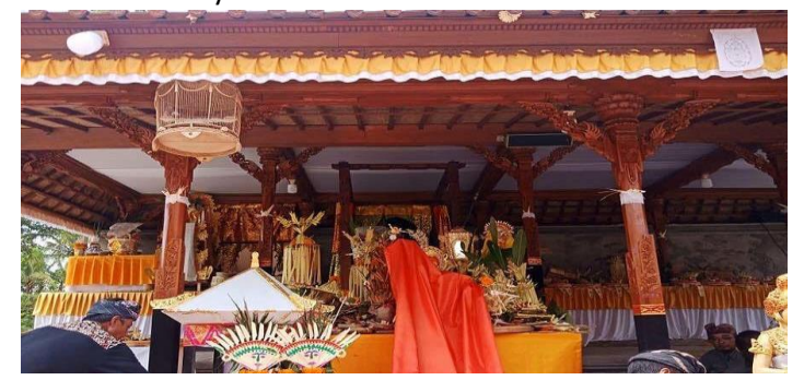
Figure 2. Offerings to God in the Ngaben ceremony

In addition, the Foundation's management also provides sacrifices and dedication as a form of accountability to God. The sacrifices and dedication made by the