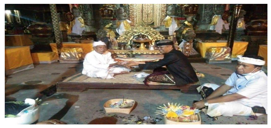
Figure 3. Buffalo donation at Kehen Temple, Bangli

In accountability activities, the SMKS Foundation provides economic contributions to employees as well, one of which is by creating job opportunities for the community around Bebalang Village, then also making economic contributions to employees or work teams at the crematorium, because the success achieved by the Foundation at this time did not escape the efforts and the hard work of the human resources within the Foundation, namely the team of workers in the crematorium unit. So, the Foundation's management must pay attention to the welfare of the crematorium work team, namely by giving bonuses on Galungan and Kuningan Day, besides that the work teams also receive social assistance in the form of basic necessities from the Foundation.