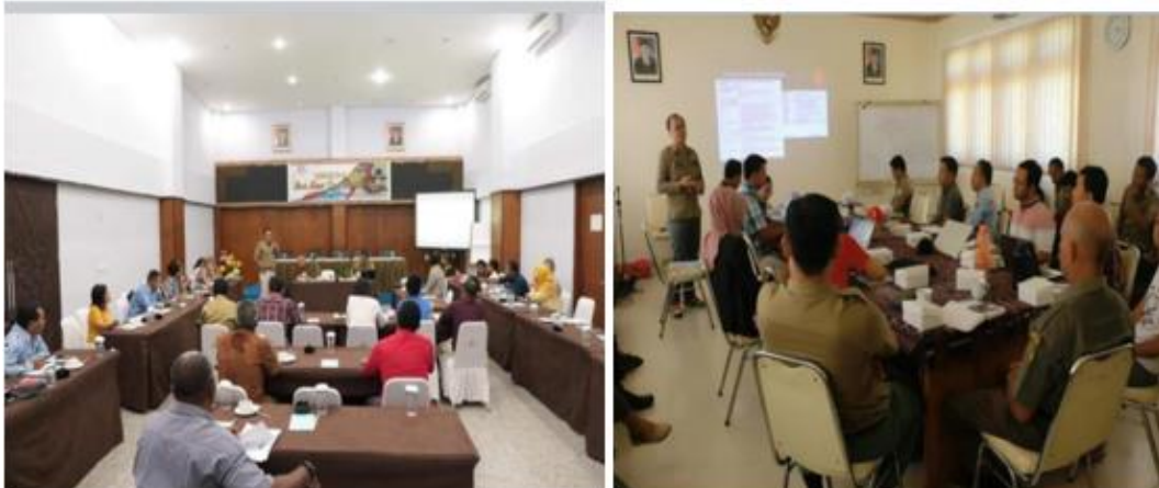
Figure 2. Conservation Area Management Effectiveness Meeting with METT