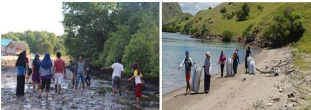
Figure 3. Waste Management and Mangrove Planting

This is in accordance with the results of interviews conducted with MW1 source who have conveyed that the form of responsibility of the BTKN in overcoming the impacts resulting from the management of Komodo National Park has been carried out based on the contents of the performance agreement that has been made. Therefore, the form of responsibility given must be realized in a tangible form, the implementation of which is outlined in the application of good governance by applying the principles of responsibility, such as: 1). Integrated supervision of conservation areas and national park zones, 2). Conduct education and guidance on the importance of maintaining and maintaining Conservation Areas, so as to provide benefits to the community's economy and