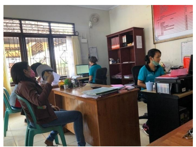
Figure 4. Transactions between Treasures and Customers at the BUMDesa Wija Sari in Samsam Village