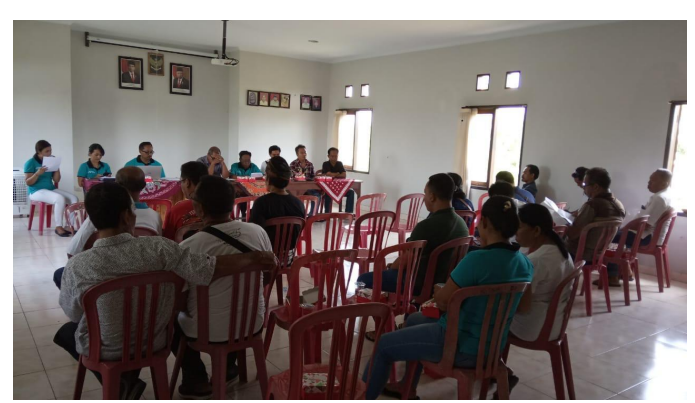
Sari & Sudana Managerial Accountability of Village-Owned Enterprise Wija Sari: A Case Study Research

Figure 2. General Meeting Work Plan of BUMDesa Wija Sari in Samsam Village