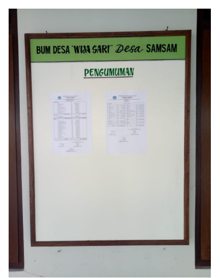
Figure 5. Announcement Board BUMDesa Wija Sari in Samsam Village

Managerial Accountability of Village-Owned Enterprise Wija Sari: A Case Study Research