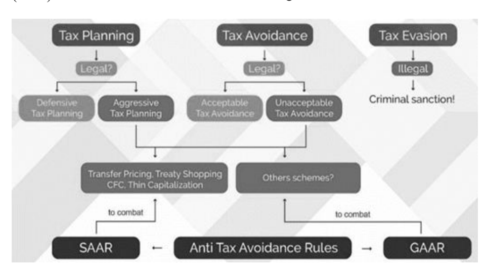
Figure 2. Relationship between Tax Planning, Tax Avoidance and Tax Evasion

arrangement of transactions to obtain profits, benefits, or tax deductions in ways that are not desired by tax laws. The relationship between planning, avoidance and tax evasion is explained in Figure 2.