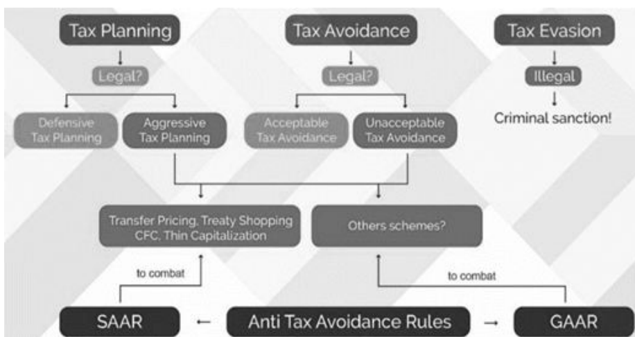
Figure 2. Relationship between Tax Planning, Tax Avoidance and Tax Evasion

arrangement of transactions to obtain profits, benefits, or tax deductions in ways that are not desired by tax laws. The relationship between planning, avoidance and tax evasion is explained in Figure 2.