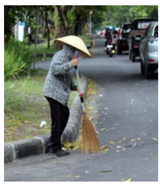
Figure 4. The work posture of street sweeper cleaners before the broomstick is designed with ergonomics applications.