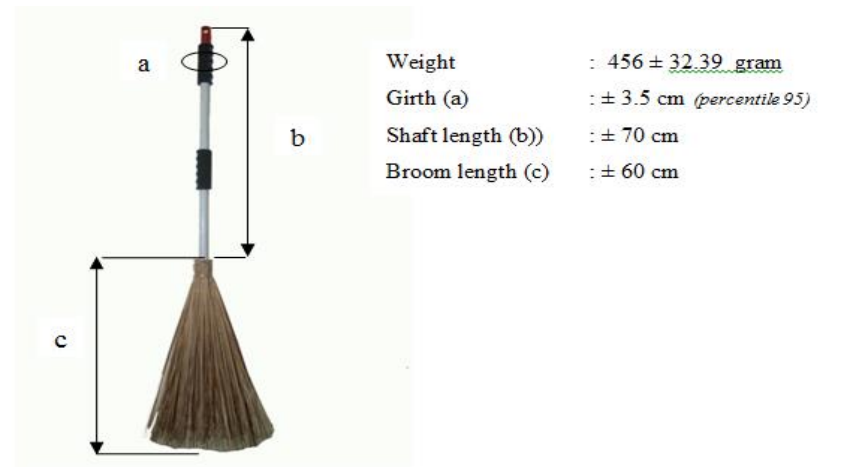
Figure 2. Broomsticks after Redesign with ergonomics applications