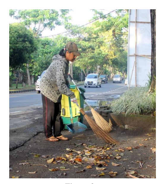
Figure 3. The work posture of street sweeper cleaners before the broomstick is designed with ergonomics applications.