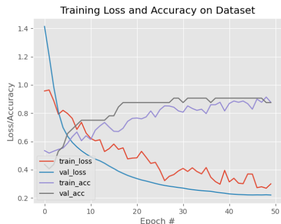
Fig. 1. Training Loss and Accuracy on Dataset

After going through the training process, we get a model that can do labeling on the inputted image, before carrying out the validation process, we first look at the graph of the training process that the model went through. From Fig 1. we can find out information that when the training ended at the 50th epoch the model built in this research had managed to get a fairly good accuracy, higher than 80% (87% to be precise). From the same image we can also see that the training loss is at a fairly small point at below 40% (29% to be precise). For data testing the model built gets the same accuracy at 87% and a smaller loss, namely 22%. This information is sufficient to prove that the model built is good enough for image classification and what is no less important is that the model built can be said to be free from overfitting problems.