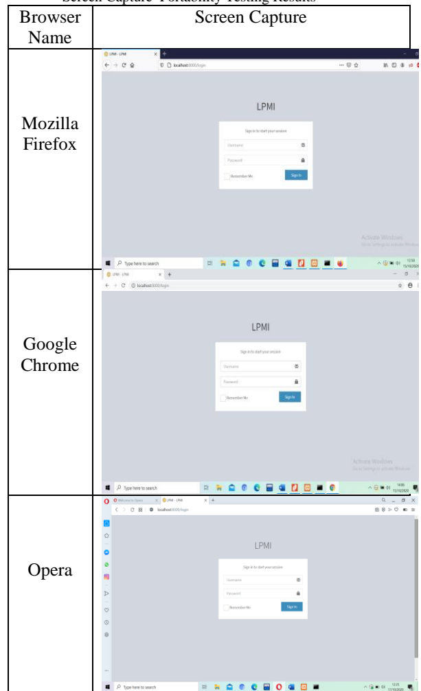
TABLE IX Screen Capture Portability Testing Results

Based on the test results above, it is known that the internal quality audit management information system STMIK STIKOM Indonesia can run well on several types of web browsers. So it can be concluded that the internal quality audit management information system STMIK STIKOM Indonesia has met the quality criteria in terms of the aspect of protection..