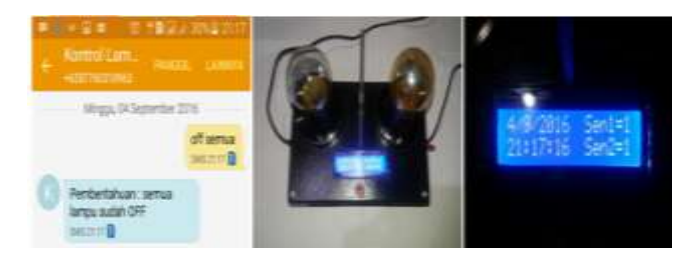
Fig. 8.Display condition at HP conditions, the lights and the LCD while receiving SMS "all off" "