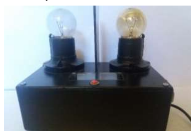
Fig. 2. Actual lighting controller utilizing a microcontroller

Realization lighting controller utilizing the microcontroller equipped with RTC and SMS can be seen in Fig. 2 to 4.