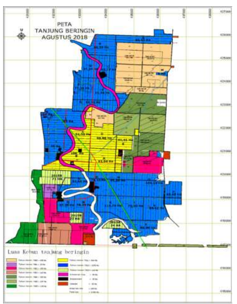
Figure 1. Map of Tanjung Beringin Area

The research procedures were as follows: selecting the location of the study, identifying the area, and identifying problems formulate to research questions. As a result, the area observed in the research was 486 hectares located at Section III, Tanjung Beringin Plantation, PT. Langkat Nusantara Kepong. Afterward, primary data were collected through open interviews to support quantitative data, while secondary data were obtained from