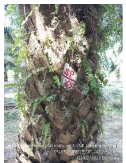
Figure 4. Bagworm infestations damaging oil palm trees

bunches. Effective pest control and proper handling can reduce the bagworm population (Pahan, 2008). With proper control, oil palm trees produce fresh fruit bunches, which will gradually raise the overall production.