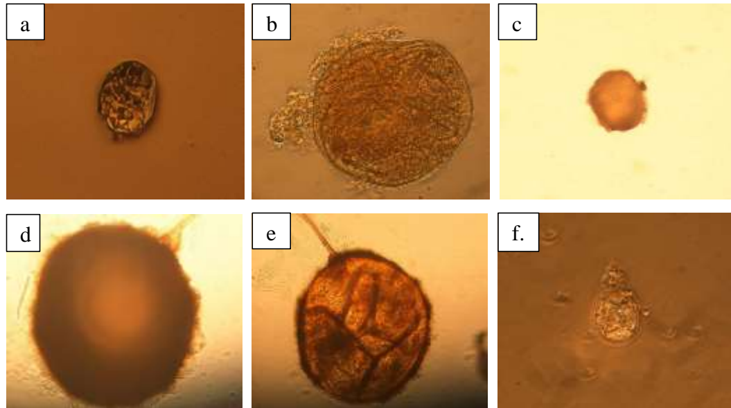
Fig 1. VAM Spores. a. Dentiscutata type 1 (magnification 200 times), b. Acaulospora (magnification 1000 times), c. Dentiscutata type 2 (magnification 400 times), d. Glomus type 1, e. Glomus type 2 (magnification 200 times), f. Gigaspora (magnification 400 times)

Presence of VAM spore is affected by several factors, namely environmental factors, host plant factors, and factors of VAM fungus itself. Environmental factors that affect to presence of VAM spores are organic matter and soil type. Organic matter is able to affect the presence of spores in soil, due to it is able to increase the nutrient content in the soil (Yusnaini, 2009). According to Johns (2017) that the addition of organic matter is able to increase the density of VAM spores. The type of soil sampling is a type of alluvial soil that contains low organic matter. However, sample plants are cultivated plants that get fertilization which contains organic matter, and allegedly the organic matter has given, has not undergone a perfect decomposition process. Besides that, Soil type affects the