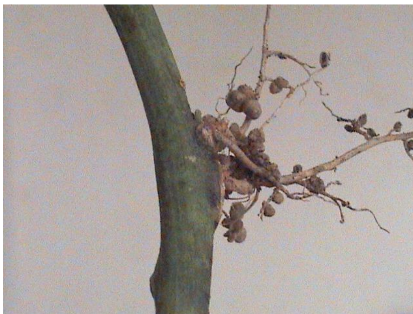
Fig. 1. Morphological photograph of Kudzu root nodules

Roots not colonized by Rhizobium do not synthesize leghemoglobin. Leghemoglobin has close chemical and structural similarities to hemoglobin, and, like hemoglobin, is red in colour. The holoprotein (protein + heme cofactor) is widely believed to be a product of both plant and the bacterium in which the apoprotein is produced by the plant and the heme (an iron atom bound in a porphyrin ring) is produced by the bacteroids (O'Brian et al., 1987). Some evidence, however, suggests that the heme moiety is also produced by the plant (Santana et al., 1998). The morphological photograph of the Kudzu root nodule are shown in Fig. 1 and Fig. 2. Nodules attached to the root by a long stalk (A) or short stalk (B), and the legHb producing bacteroids live in cortical cells of root nodules.