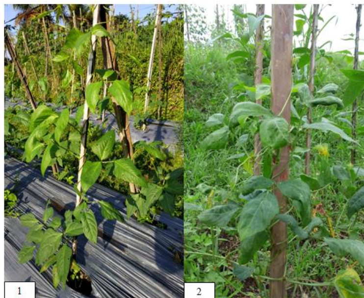
Figure 1. The comparison of healthy and infected long beans mother plants; 1. The healthy mother plant, 2. Infected mother plant

The virus brought by the long bean seeds was detected using the sample of seeds from BCMV infected mother plants cultivated in Baturiti village, Baturiti district, Tabanan regency. The comparison of healthy and infected mother plants can be seen in figure 1. The seeds samples were divided into two parts, which are embryos and cotyledons (figure 2). All molecular observation stages in this study were similar to the previous study when confirming the BCMV on the symptomatic sample plants in 2.4.