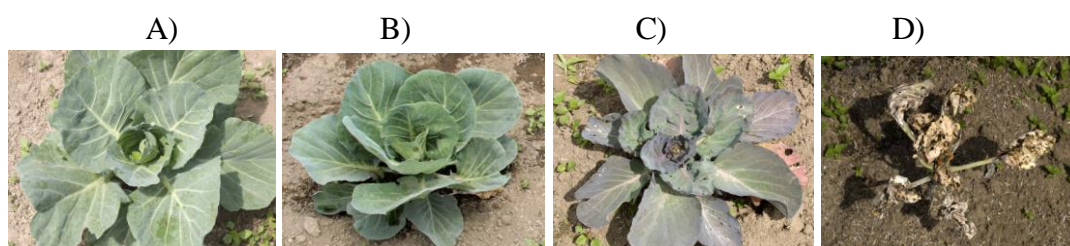
Figure 1. The phytotoxic effect of essential oil of lemongrass to cabbage. A) the health cabbage was treated with essential oil of lemongrass (1 %); B) the effect of 2.5 % concentration of essential oil of lemongrass; C) Burning symptom of essential oil of lemongrass on concentration 10 %.

Effication of lemongrass to P. xylostella in laboratory was conducted in Laboratory of Plan Protection Faculty of Agriculture Udayana University as an introduction of research. The efficacy of lemongrass was observed on 24 h and 48 h after application of lemongrass. The result shown the lemongrass was affected to mortality of P. xylostella . The field experiment of effication of lemongrass oil to P. xylostella and Phytotoxicity of lemongrass to cabbage has been conducted in Pancasari, Buleleng, Bali (1200 m asl). The result shown the high concentration of lemongrass (10%) was effected to cabbage as a phytotoxic. The symptom of high concentration (10 %) of lemongrass was detected as a burn in the leaf of cabbage. On the other hand in 5 % and 2.5 % concentration the effect of phytotoxic of lemongrass was detected as a change colour of leaf from green to purple. However for low concentration 1 %, 0.5 %, and 0.1 % the lemongrass no phytotoxic effect (Fig. 1).