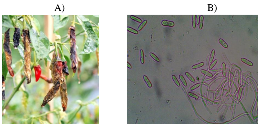
Figure 3. Field Symptoms and Microscopic Observation of Anthracnose on Chili. Field symptom (A), Microscopic observation of Colletotrichum acutatum (B).