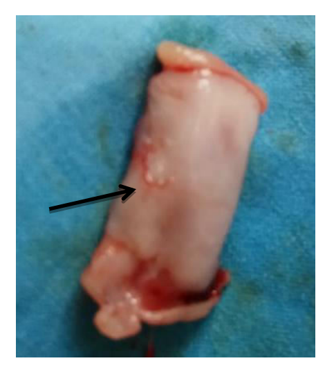
Fig 2. Part of amputated rectal and the ulcerated part (black arrow)