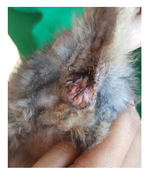
Fig 5. Purse String technique in anal edge

For post surgery care, kitten was given an antibiotic of amoxicillin syrup with the doses of 0.2 ml given 3 times a day and anti-inflammatory of dexamethasone with the doses of 0.1 gram given twice a day. For topical treatment, neomicyn and dexamethasone ointment was given which has anti-inflammatory and antibiotic content. During post surgery care, antibiotics were given to prevent infection in the surgical wound. Amoxicillin works by inhibiting bacterial wall synthesis. Anti-inflammation was given to reduce the inflammatory effect in patients. Dexamethasone is an anti-inflammatory and immunosuppressive which is 30 times more potent than cortisol. The anti-inflammatory effects of this drug are fairly