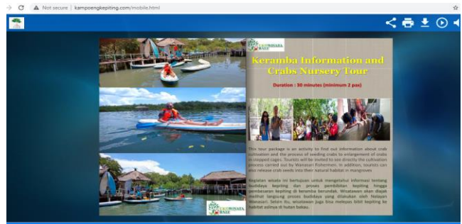
Fig. 6. Tour of Crab Cage

Fig.5 shows a scope of work of mangrove ecotourism and canoe tour packages. Guests can play a fun canoe while picking up and carrying plastic waste found around the mangrove waters. After doing activities as a reward for the collected garbage, visitors get mangrove juice. This activity related to the environment concern. Digital books provide information to prospective visitors to find out canoe tours with environmental awareness activities.