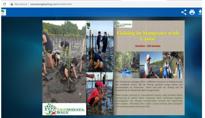
Fig. 7. Mangrove Plantation And Canoe Fishing Tour

This tourism activity as seen in Fig. 6, aims to find out information about crab cultivation and the process of crab breeding to crab rearing in terraced cages. Tourists will be invited to see firsthand the cultivation process carried out by Wanasari Fishermen. In addition, tourists can also release crab seeds to their natural habitat in the mangrove forest. The digital book provides information to potential visitors about crab cultivation in Mangrove ecotourism.