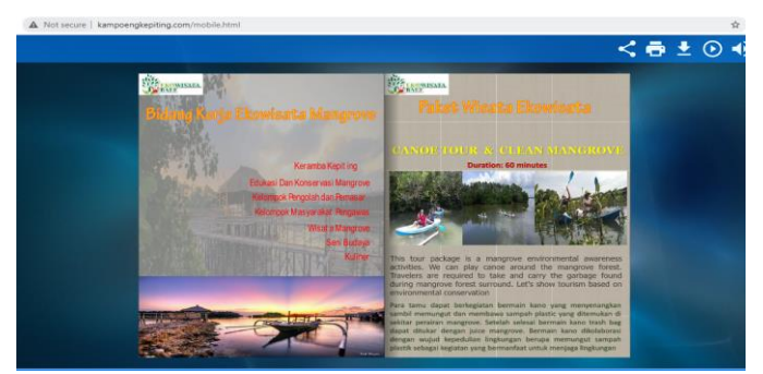
Fig. 5. Scope of Work and Canoe Tour Packages

Fig.5 shows a scope of work of mangrove ecotourism and canoe tour packages. Guests can play a fun canoe while picking up and carrying plastic waste found around the mangrove waters. After doing activities as a reward for the collected garbage, visitors get mangrove juice. This activity related to the environment concern. Digital books provide information to prospective visitors to find out canoe tours with environmental awareness activities.