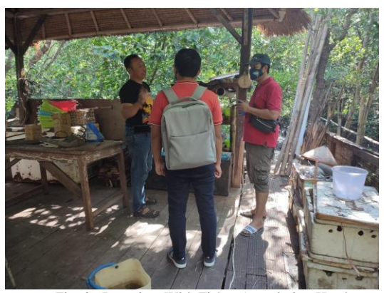
Fig. 3. Interview With Fisher Association Head

ecotourism. During the pandemic, the condition of the tourist attraction and Kampoeng Kepiting culinary was deserted.