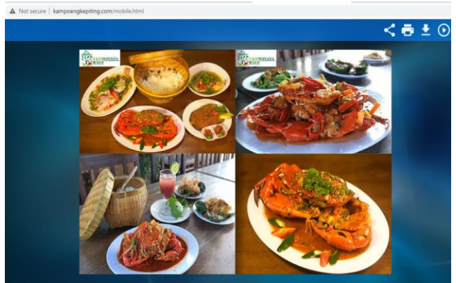
Fig. 9. Culinary Menu Kampoeng Kepiting

The digital book application provides information on fishing packages around mangroves using traditional boats owned by Wanasari fishermen as seen in Fig.8. Fishing activities can be done in the morning, afternoon or evening depending on wheater conditions. Fishing locations around mangrove forests and the Bali Mandara toll road or in the Benoa Bay area. This activity provides a pleasant sensation to visitors, which is tools and bait for fishing will be prepared by the Bali Ecotourism management.