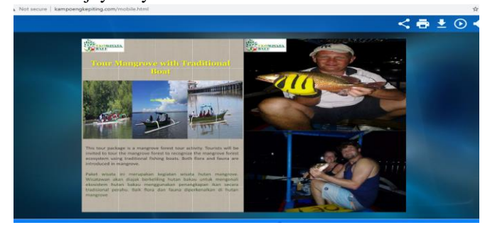
Fig. 8. Fishing Tour Using Traditional Boat

planting, tourists will be given information about mangrove trees both in terms of functions and benefits. The planting technique that will be carried out is clumps, system technique 1 bamboo 2 trees. Treatment will be carried out by officers of the Wanasari Fisherman Association. Each participant will be given 2 mangrove tree seedlings to be planted immediately. While this canoe fishing tour offers a different sensation in fishing around the mangrove forest. Activities in the form of fishing using canoes and accompanied by fishermen, and equipment and bait for fishing will be prepared by the Bali Ecotourism manager. The digital book application provides information about fishing packages that can be enjoyed by visitors.