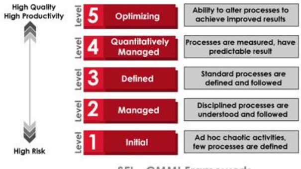
SEI - CMMI Framework

After self-assessment filled in and calculated based on sub domain of Access Control, the result is showed in Table 1.