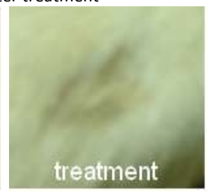
Fifteen days after treatment Figure 1 Wound Healing in Treated Group and Control Group

Figure 1 shows the significant increase in the wound-healing activity was observed in the animals treated with the C. roseus extract compared with those who received the placebo control treatments.