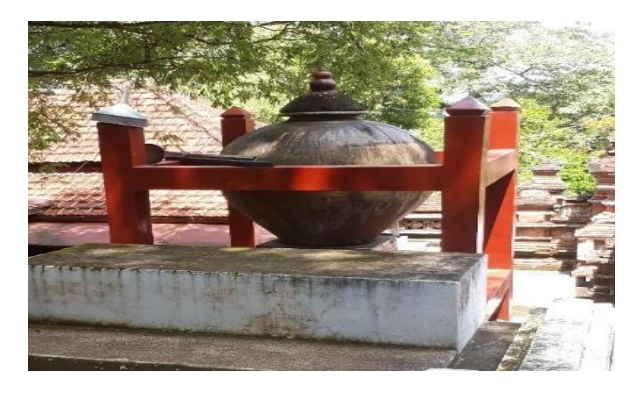
Figure 3. Kingdom Jug

A jug or Barrel is being ornamented complementary on the main gate toward the area of Sultan Agung. It begins that jugs functioned is as a water container that used to clean up the body before praying (Sholat). Jugs were obtained from every dear friends of kingdoms as souvenirs. The picture 3 is a visualisation of a jug or barrel.