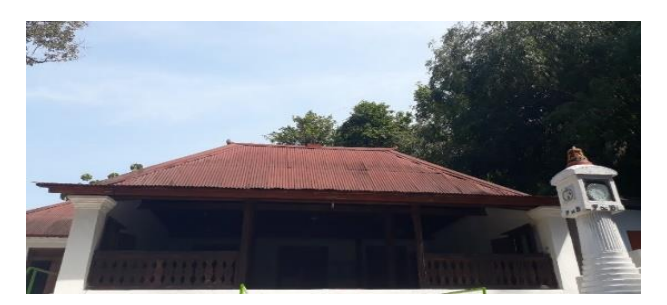
Figure 4. The Roof of Pajimatan Imogiri Mosque

roof in limasan that serves as the terrace and the entrance. A picture 4 explain the form of the roof of the mosque pajimatan imogiri.