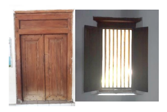
Figure 5. Details of Door and Window of Pajimatan Mosque Imogiri

In a Pajimatan Imogiri Mosque, there are three main entrance with the same size and engraving. The door links between the porch and the core mosque, ablution, and the core ablution pawestren (space and room for ladies) mosque in the side to the core. Mosque picture 5 shows the details of the Pajimatan Imogiri Mosque (left) and detailed window of Pajimatan Imogiri mosque (right)