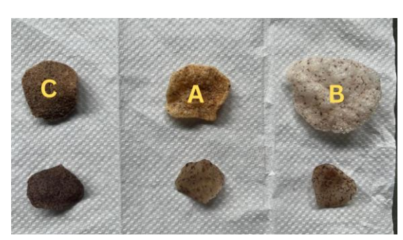
Figure 2. Three Crackers

The different colors among those three crackers is shown in the Figure 2.