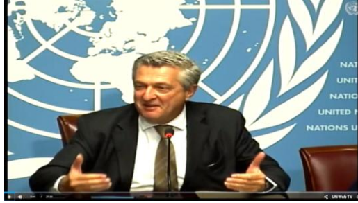
Figure 2. Press Conference release of Filippo Grandi's report