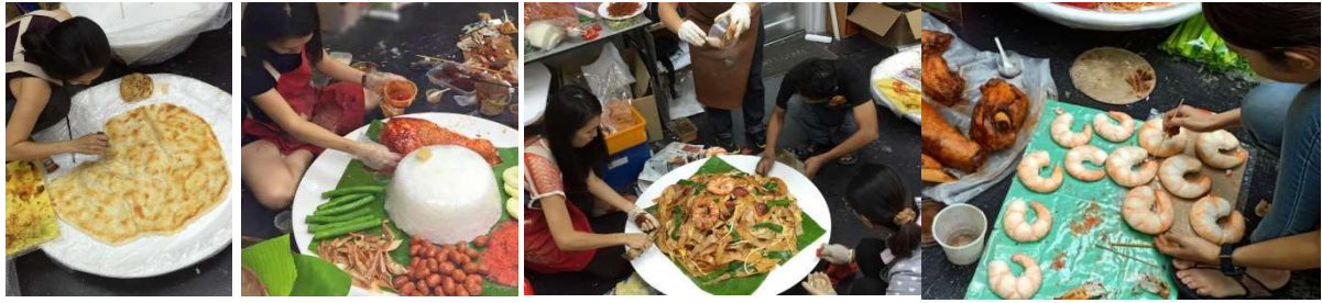
Figure 3: Wonder Food Museum's exhibits production

Shokuhin sampuru (food sample), a widespread Japanese art of replica foods was invented by Takizo Iwasaki and Suzu in 1932 (Iwasaki Co., Ltd., 2011). Since then, the culture of using Shokuhin sampuru has become a popular practice by many Japanese restaurants to display their signatures' dishes on shop windows to attract customers. Today, as times have changed, the roles of replica foods have evolved from just dish samples for restaurant promotion to art that pursuit of reality. As reported by Jared Lubarsky in the New York Times (1985), the craftsmanship of replica foods has been raised to an art form. Japanese plastic food models by the Maizuru Company were exhibited at London's Victoria and Albert Museum in 1980. Meanwhile, in addition to its traditional roles, replica foods are also being used in many ways, for instance, decoration display for restaurants and grocery, props for movies, television shows, and theatrical plays. In the 20th century, models of foods and dishes were also used for nutrition education and consumer research (Tamara Bucher et al., 2012). In brief, over the years, replica foods have developed from being fake foods made from plastic, silicone, and resin. They are now cultural artifacts with a global presence that developed alongside with Japanese gastro-diplomacy.