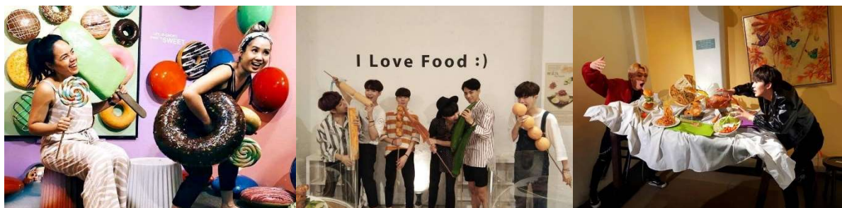
Figure 7: Interactive exhibition design at Wonder Food Museum

exhibition, there are exhibits for display, and exhibits serve as “prop” to bridge visitor’s engagement. For instance, in Wow Zone, visitors are allowed to “play” with exhibits, it is an exhibition area that stimulates visitors’ participation through the freedom to create and explore. In addition to physical interaction design, exhibits and spatial planning of the museum have also been designed as a kind of “Pop-up Museum” to cater to visitors’ interest, particularly on young audiences’ passion for the selfie phenomenon. According to Manuel Charr (2019), millennials are new generation that constantly searching out the perfect selfie moment and cultural experiences to enrich their social media feeds. With such a change in the contemporary cultural landscape, the concept of pop-up museums is growing popular worldwide. Emre Cetin (2019) also mentioned that pop-up museums as interactive and “Instagrammable” creative spaces are becoming a new phenomenon.