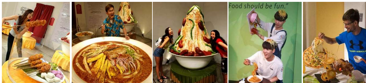
Figure 5: Wow Zone's exhibition

(2) Wow Zone is where the "food wonderland" and its fantasy takes place. Different sections such as 'Multi-colored foods', 'Colorless foods', 'Weightless foods', and 'Giant displays' are designed to stimulate visitors' interaction with foods. For instance, under the giant display section, Malaysia's well-known dishes such as Cendol, Laksa, Curry Mee, Rojak, Char Kuey Teow and etc were made in a gigantic size to excite visitors and challenge their perceptions about foods.