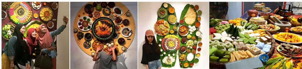
Figure 4: Info Zone's exhibition

culture. In short, the Info Zone is a gateway to the food wonderland with a grand presentation of Malaysia's culinary heritage.