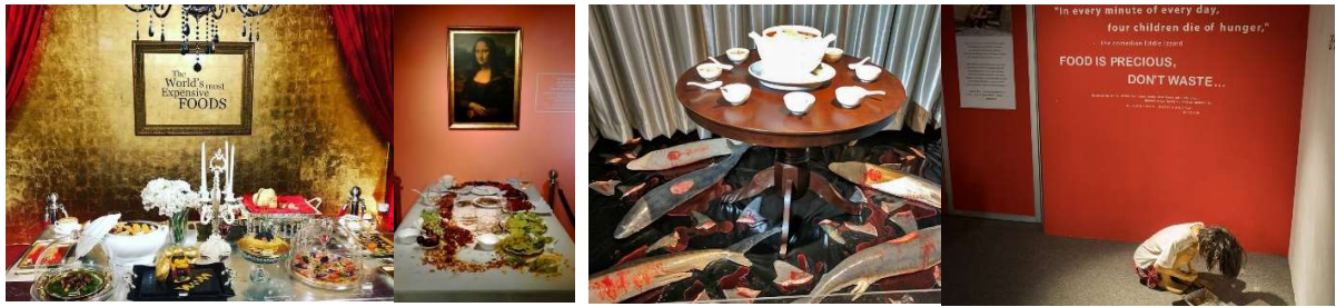
Figure 6: Educational Zone's exhibition

By and large, the Info Zone is devoted to showcasing the wonder of Malaysia's cultural diversity through its food heritage. The Wow Zone is a food wonderland designed to inspire visitors' participation, and the Educational Zone is dedicated as the zone of enlightenment.