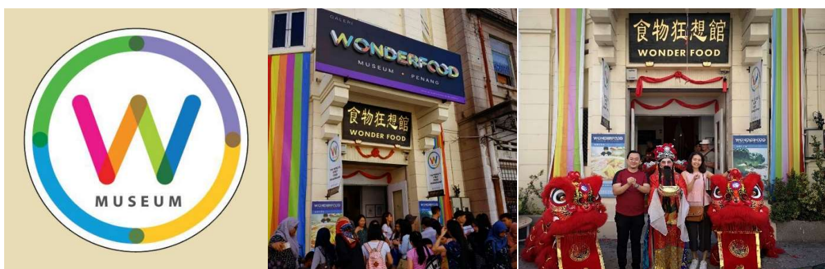
Figure 1: Wonder Food Museum

The Wonder Food Museum is located in George Town, Penang, Malaysia. It was a private museum established in November 21, 2015. Situated inside Georgetown's colonial architecture built in the 1940s , the museum is the only one of its kind in the world that celebrates diverse Asia dietary . Meanwhile, with a focus on showcasing Malaysia's food culture, the museum is a great place to discover Malaysian culinary heritage . According to Sean Lau (Museum Founder and Director), Wonder Food Museum's mission is to document, preserve, and promote Malaysia's unique food culture which reflects the multiculturalism of the nation. Meanwhile, the Museum's additional, yet not lesser mission is to research, exhibit, and publicize the rich culinary heritage of Asia for the benefit of local residents and international visitors. In sum, Wonder Food Museum is a new kind of museum in Malaysia that delicate to showcase Malaysia's food culture with exhibits that allow visitors to "plean" (play + learn) with. It is an "edutainment" museum that incorporates elements of entertainment and interactivity into its exhibitions to maximize visitors' experiences. As said by Sean Lau, "Wonder Food Museum is a food museum plus wonderland that aims to provide a rich educational experience on food culture, and inspire creativity and curiosity within every individual."