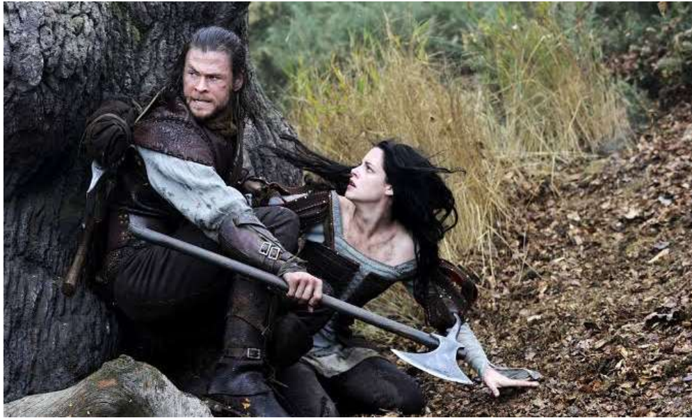
Figure 1 Snow white becomes a fearless fighter

unfavourable events is drastically changed. In “Snow White and the Seven Dwarfs,” she upholds her faith in good and uses this message to portray her distinctive good nature, which, ultimately, turns out to be her salvation (Chen, 2024). Her response towards the poisoned apple indicates her passivity as well as her wishful thinking where later Charming Prince wakes her up and she realizes that true love can do miracles.