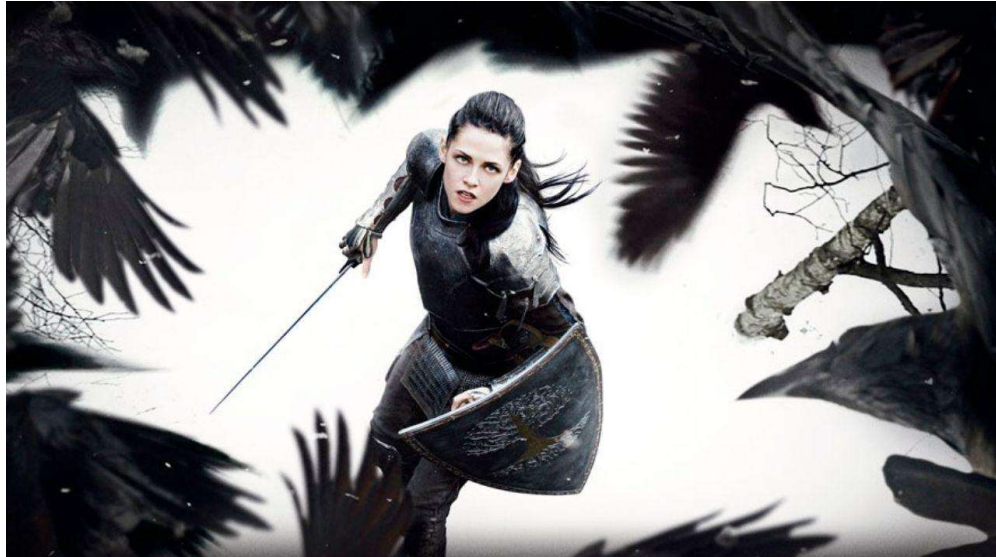
Figure 4 Snow white in the Armour

saved by the prince she was the one who saved herself. Her ability to lead the troops proves that she has shifted from an innocent princess to a warrior.