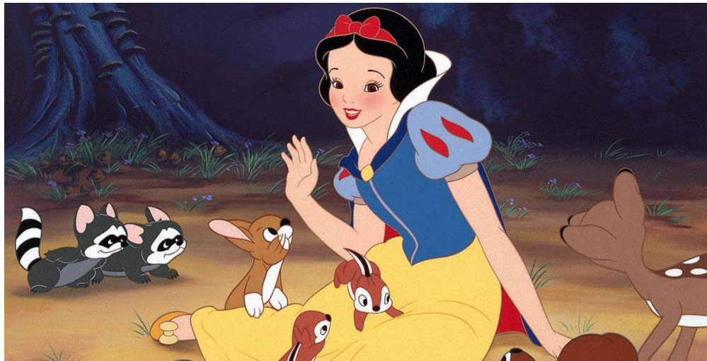
Figure 2 Snow white in the “Snow White and Seven Dwarfs”