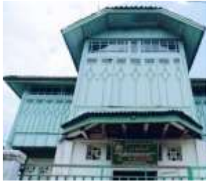
Greenhouse After Restoration