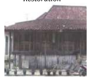
Limas House Before Restoration