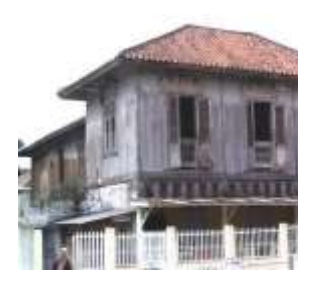
Land Twin House Before Restoration