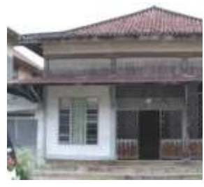
Stone House Before Restoration