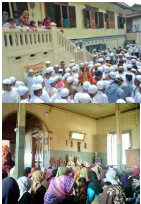
Figure 3: Wedding Ceremony in Al Munawar Arab Village