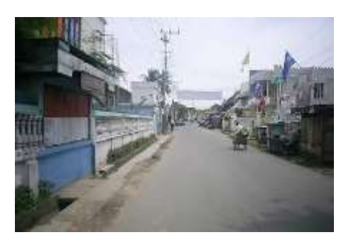
Figure 4: Access to Al Munawar Arab Village

The statement above shows that Al Munawar Arab Village is very easy to reach because of good road conditions and supporting transportation. The statement above is in accordance with the observation results, as seen in the image below: