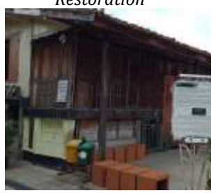
Limas House After Restoration