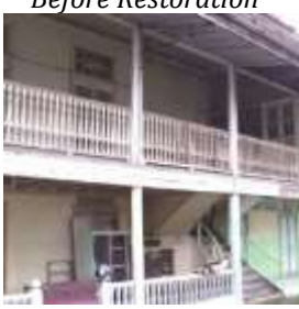
Sea Twin House Before Restoration