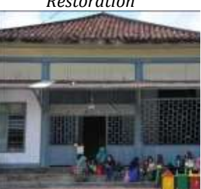
Stone House After Restoration