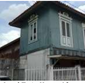
Land Twin House After Restoration