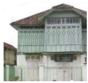
Greenhouse Before Restoration